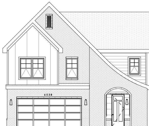
ELEVATION OPTION C

NOTE: STONE SUBSTITUTION AT BRICK AREAS AVAILABLE FOR AN ADDITIONAL COST ON ELEVATIONS B & C.