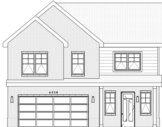
ELEVATION OPTION B

NOTE: STONE SUBSTITUTION AT BRICK AREAS AVAILABLE FOR AN ADDITIONAL COST ON ELEVATIONS B & C.