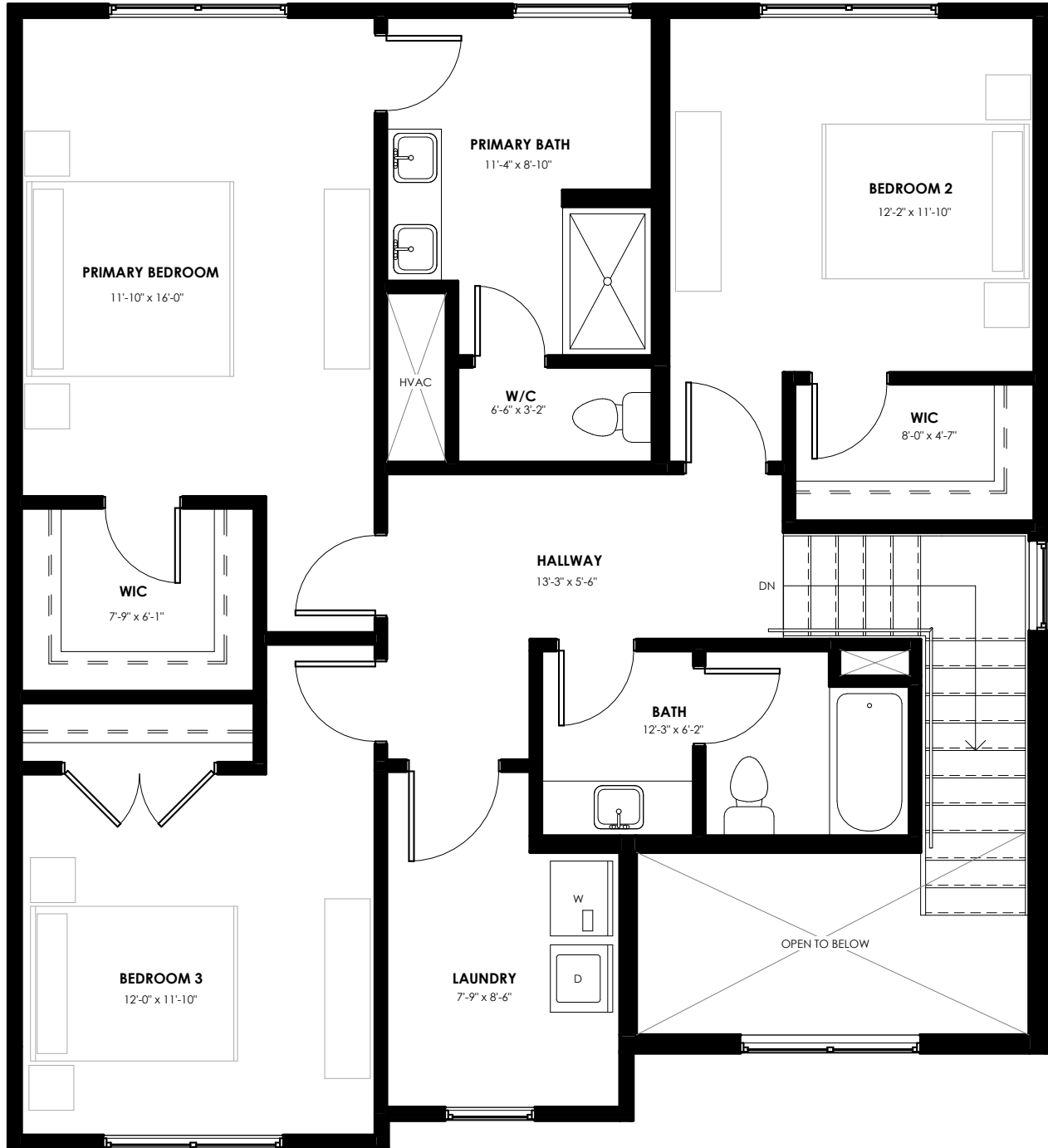
LEVEL 2 FLOOR PLAN