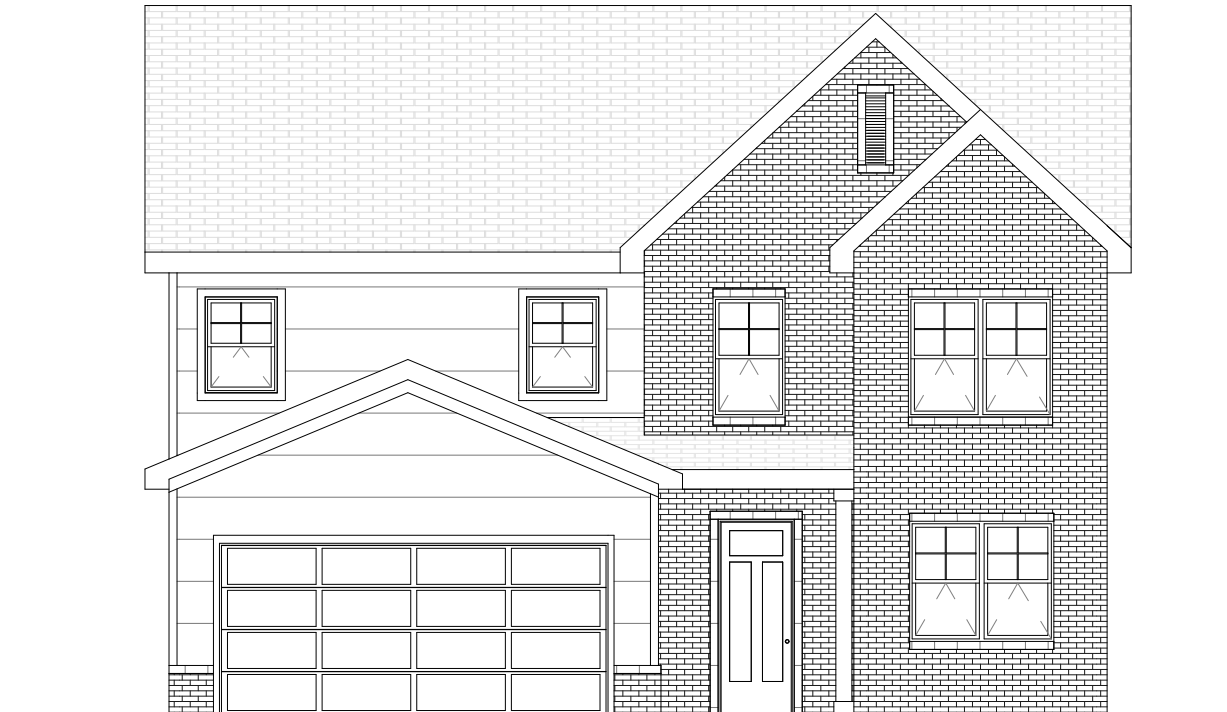
ELEVATION OPTION B