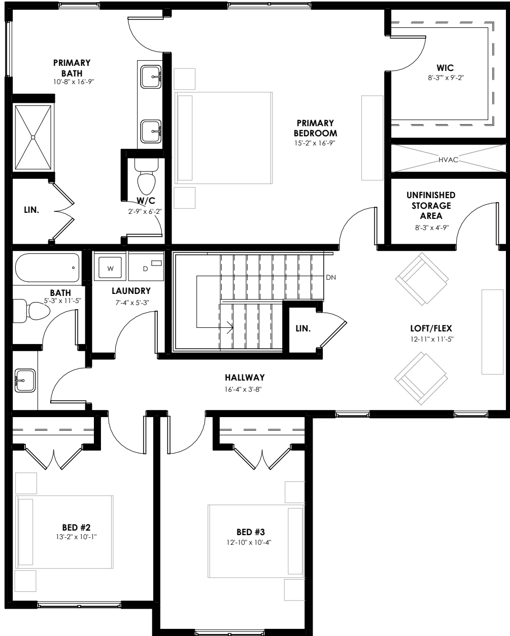
LEVEL 2 FLOOR PLAN