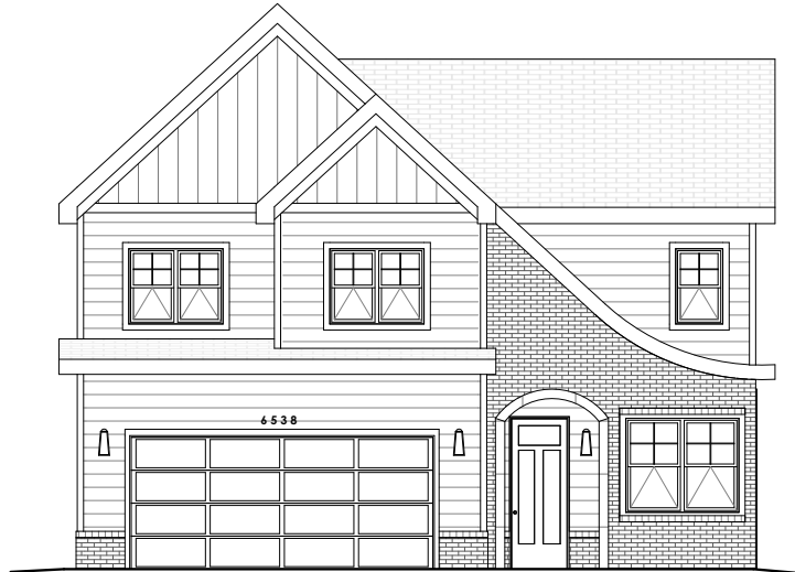
ELEVATION OPTION B

NOTE: STONE SUBSTITUTION AT BRICK AREAS AVAILABLE FOR AN ADDITIONAL COST ON ELEVATIONS B & C.