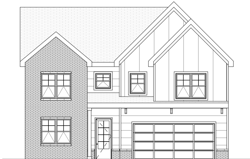
ELEVATION OPTION B