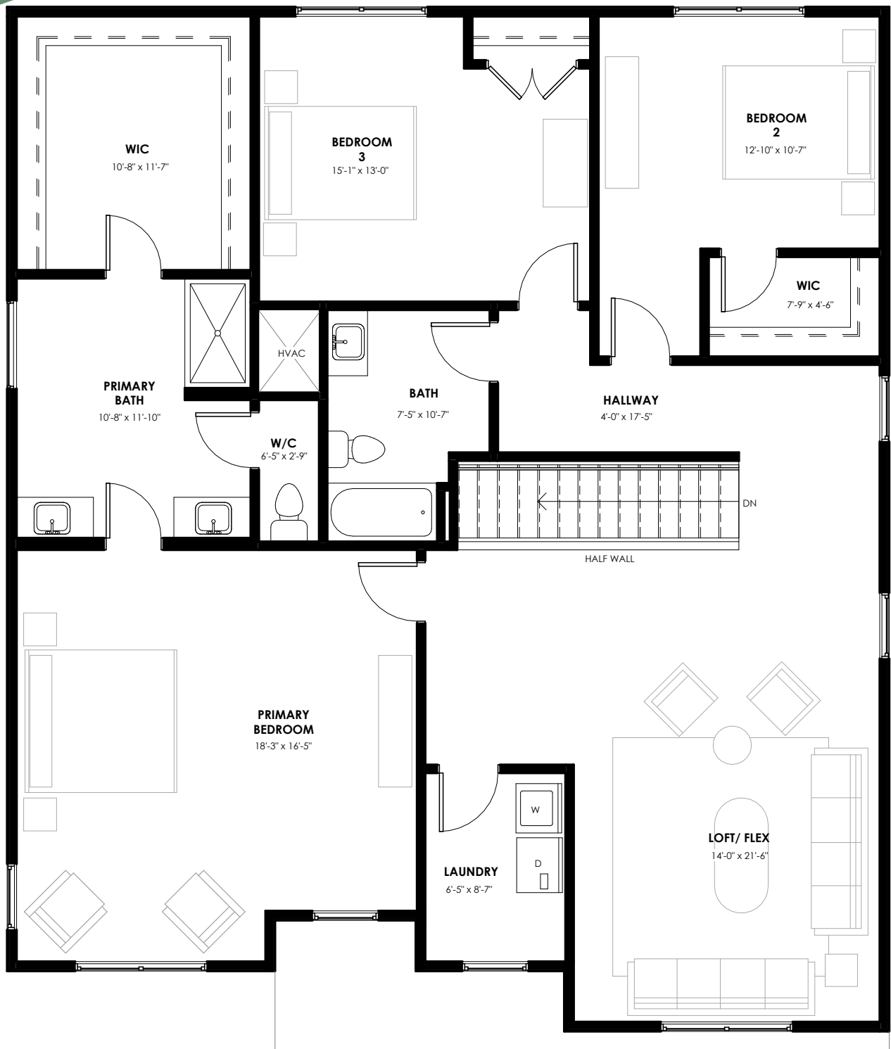
LEVEL 2 FLOOR PLAN