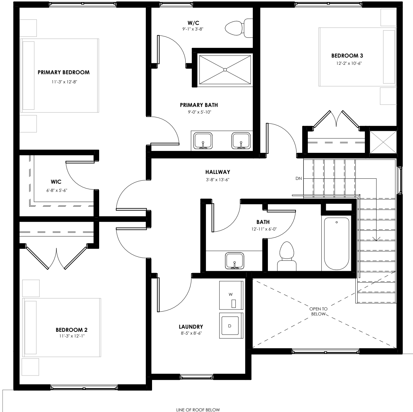
LEVEL 2 FLOOR PLAN