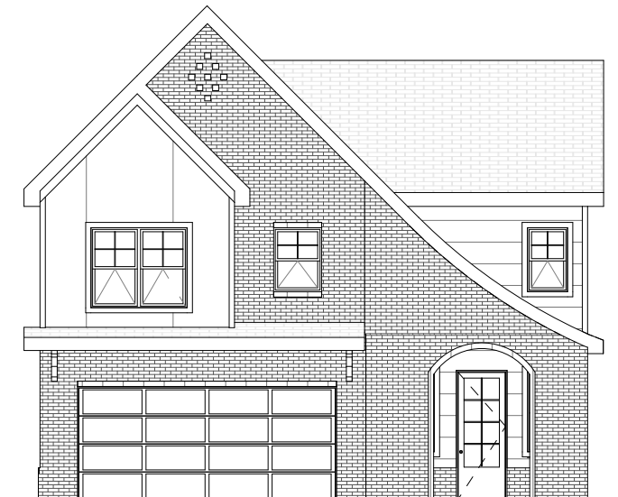
ELEVATION OPTION C