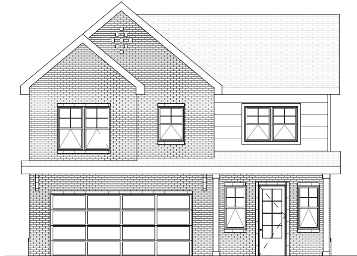
ELEVATION OPTION B