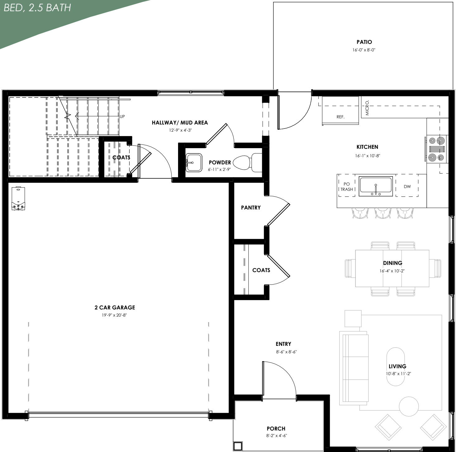
LEVEL 1 FLOOR PLAN