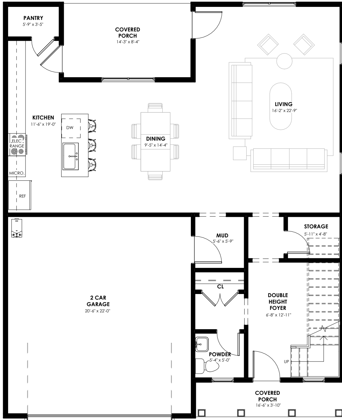
LEVEL 1 FLOOR PLAN