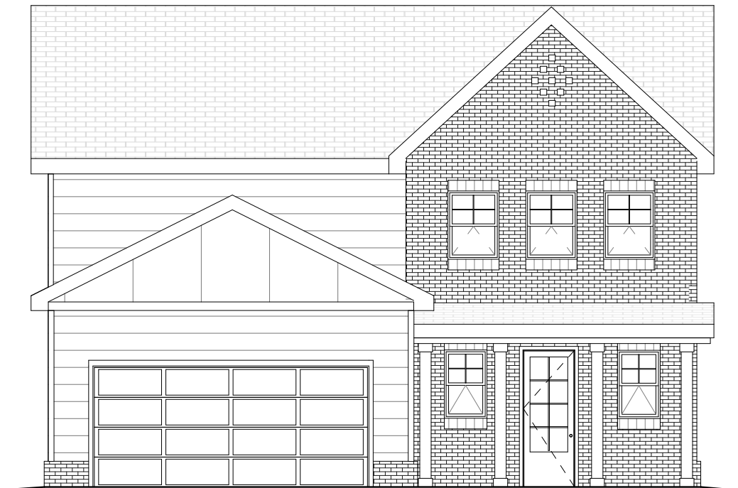
ELEVATION OPTION B