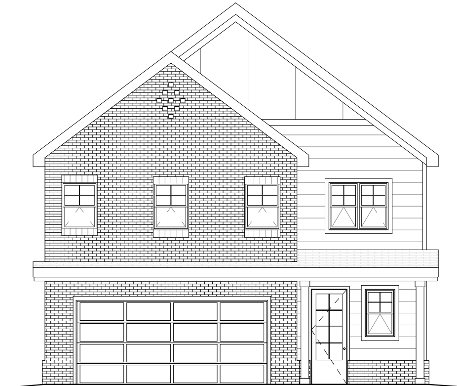
ELEVATION OPTION B