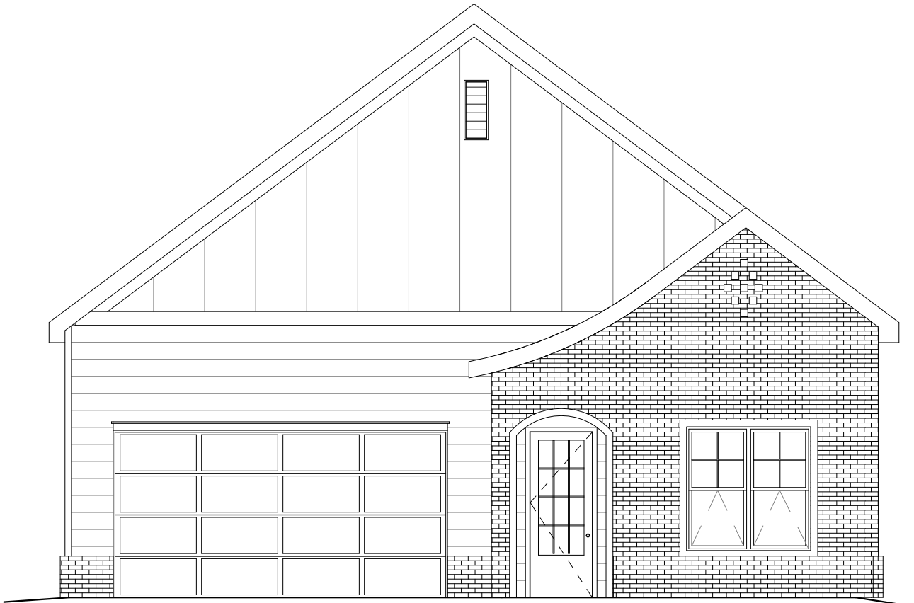
ELEVATION OPTION B